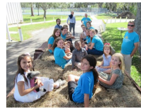
< Children and adults enjoyed hayrides after the meal for anniversary Sunday last month.

✓ Thanks to those who helped decorate the church for Christmas!