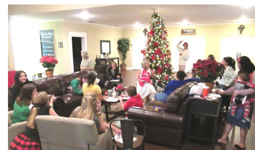
^ The ladies started off the Christmas season with a dessert night on 11/28.