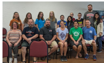
^ Teens AND parents had a great time at the "Battle of the Ages" youth activity. Check out the video posted on Facebook to find out who won the battle!