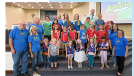
^ Pics from last month: Men's Softball, Easter Sunday, Awana Awards Night